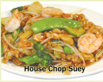
House Chop Suey