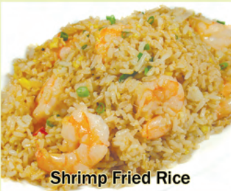
Shrimp Fried Rice