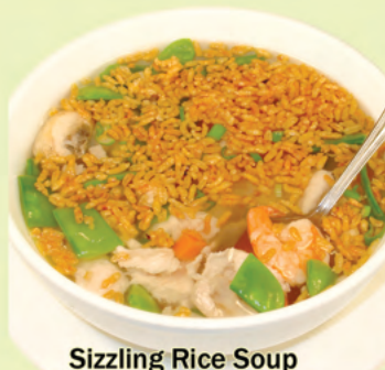
Sizzling Rice Soup