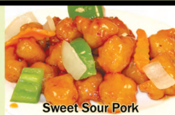
Sweet Sour Pork