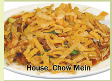
House Chow Mein