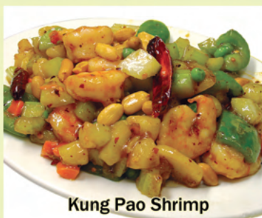
Kung Pao Shrimp