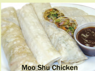
Moo Shu Chicken