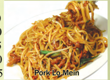
Pork Lo Mein