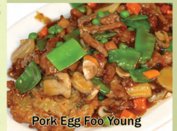
Pork Egg Foo Young