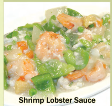
Shrimp Lobster Sauce