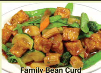
Family Bean Curd