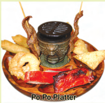
Po Po Platter